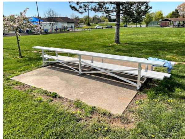
Figure 3: Pavilion #2 Location

(Note: Bleachers are not permanent structures; they will be moved off slabs by Town Staff for project)